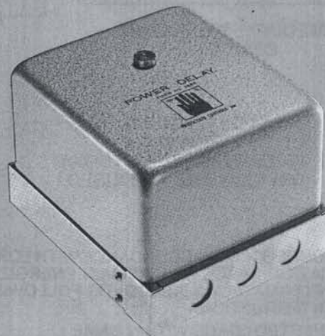
ENCLOSED STYLE DIMENSIONS 6 1/8" W x 7 3/8" H x 5 1/8" D