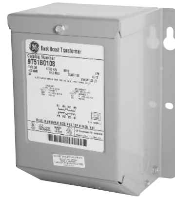
Indoor/Outdoor Type QB Transformer; Single-Phase